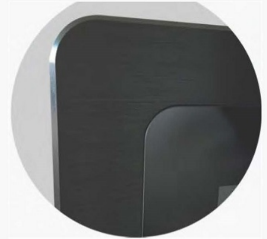
Ultra Plane Aluminum Alloy